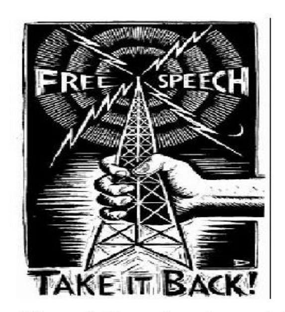
Silence is the voice of complicity...