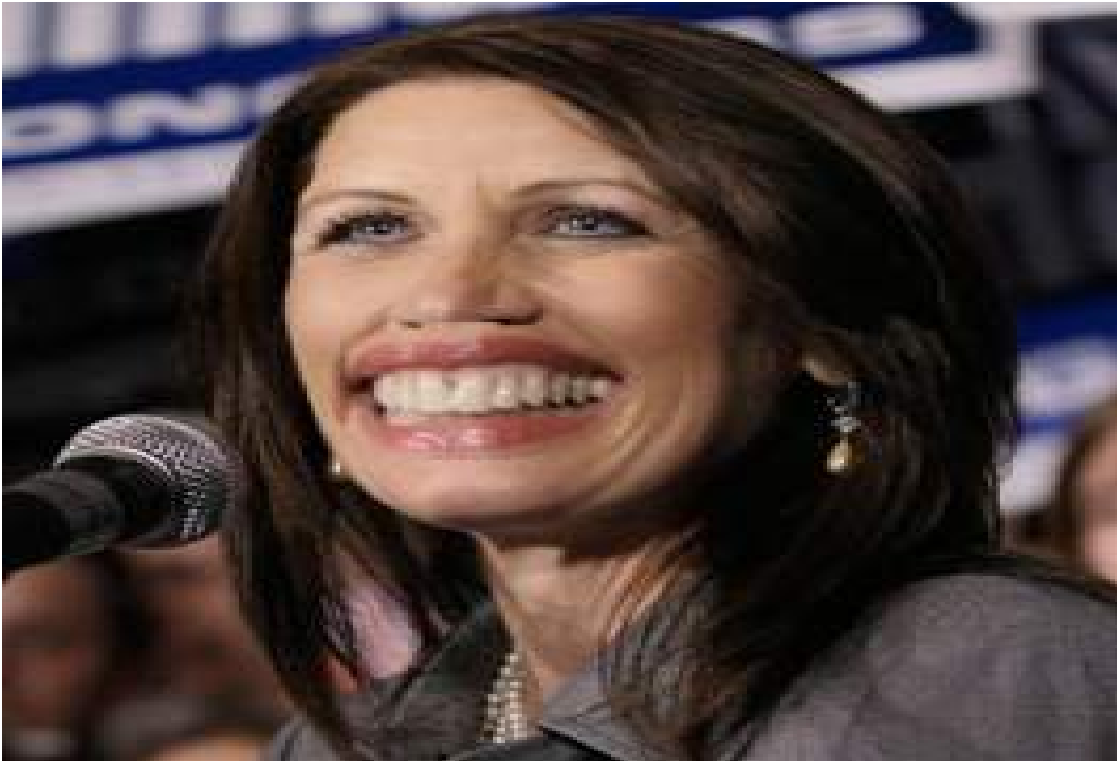
Typical US Congress person

There is absolutely no difference in the psychological makeup between failed psychopaths and the ones that go undetected. None! They are both bat-sh*t crazy.