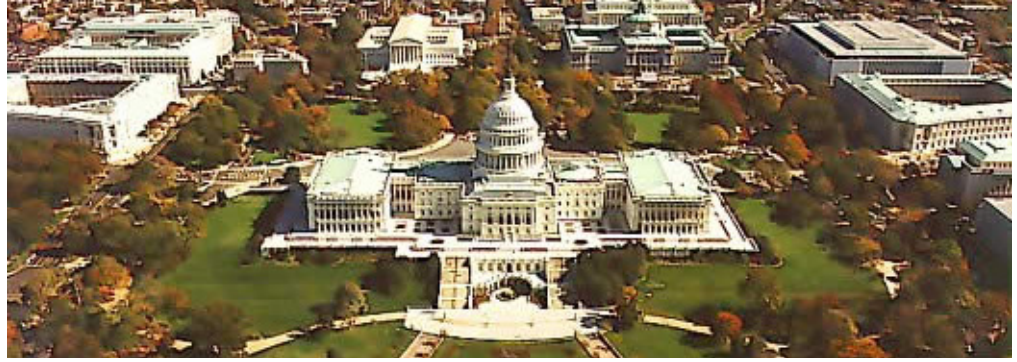
Aerial view of the Capitol Hill in Washington DC