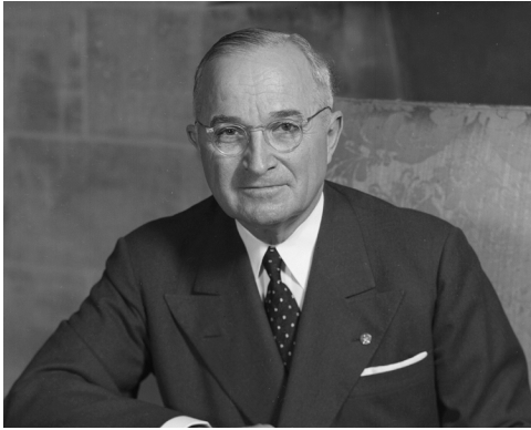
Harry S Truman, the 33rd President of the United States